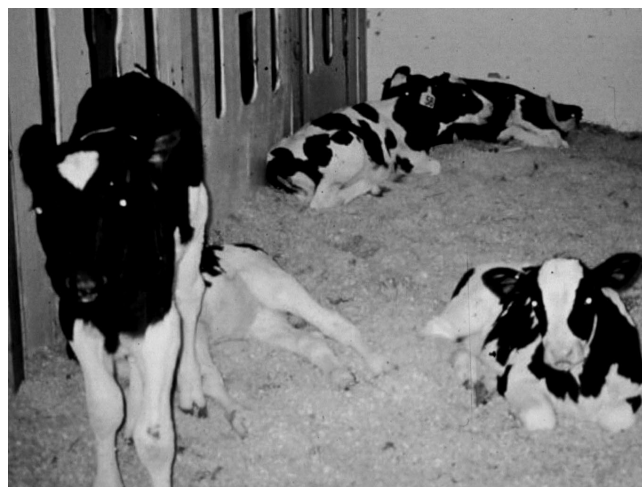
Figure 1. Housing calves in small groups can provide advantages over individual housing, but is only recommended for good calf managers.

Group rearing allows for early social interactions that have been shown to be important in the development of normal social responses later in life. Group housing provides improved access to space, allowing for more vigorous activity and play. Grouping calves also reduces the labor associated with cleaning calf pens and calf feeding.